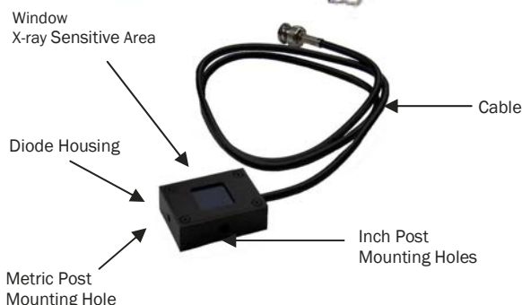
PIN Diode Detector Module

The integrated PIN diode detector system is designed for optics and beam alignment applications in X-ray diffraction instruments with in-house (rotating anode and sealed tube) and synchrotron sources. The amplifier module has a built in voltage display for visual intensity monitoring and a direct TTL pulse output which can be read by any counter/time card in a computer.